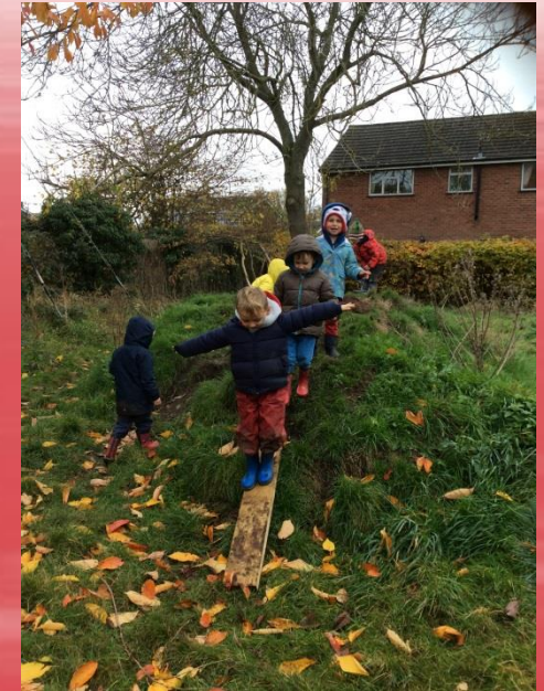
Health and Self Care